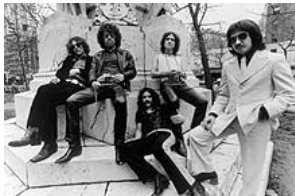
Blue Oyster Cult, circa 1976, from left: Allen Lanier, Eric Bloom, Albert Bouchard, Joe Bouchard and Donald "Buck Dharma" Roeser

It still ripples through our culture. Released more than 30 years ago, Blue Oyster Cult's "(Don't Fear) The Reaper" has become a touchstone. It is still heard on classic-rock stations, in movies ( Halloween and others) and even in videogames ( Rock Band ).